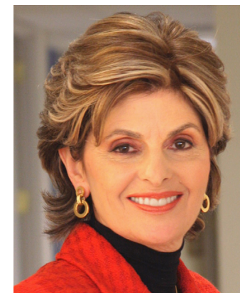
2023 FAY STENDER AWARD HONOREE Gloria Allred